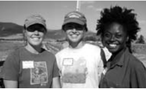
INTERNS AT THE COMMON GROUND FARM IN ARLEE

T hat was the bad news. The good news is that the funders listened. They signed up in record numbers to come to Montana and take a first-hand look at a rural state. Here, they saw a microcosm of not only the problems of one rural state but also the innovative work being done by several Montana nonprofit organizations.