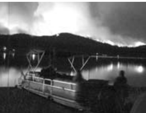
SEELEY LAKE ON FIRE, FOUR DAYS BEFORE ARRIVAL OF SEVERAL FUNDERS ATTENDING THE RURAL PHILANTHROPY CONFERENCE.

rural America. “When it comes to grant-making, many in rural America feel they are in the wilderness,” he said. Citing disparities in philanthropic giving between rural and urban states, Senator Baucus talked about the so-called “philanthropic divide” between states with large foundation assets and those without. Among the 10 rural states with the least amount of assets, Montana ranks right near the bottom.