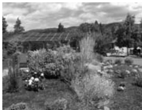
HEART VIEW CENTER GARDEN WITH COVERED SWIMMING POOL IN BACKGROUND