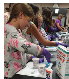
Montana GEMS of Butte discovering the possibilities.